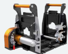
COMPACT INTEGRATED AIR MOTORS